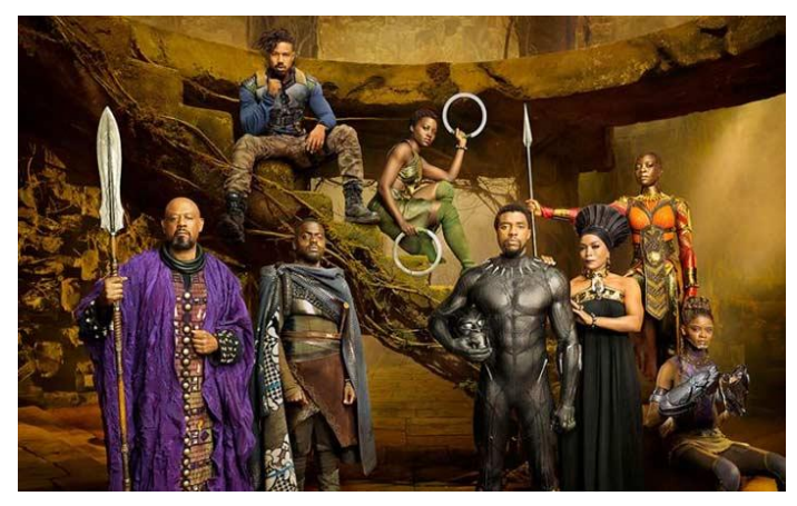
Figure 1: Black Panther (2019)

culture. Making African Americans the foundation to advance technology that leads to an enhanced future. Films like Black Panther heavily expressed it through the design of the environments and the clothing of the characters. What stood out to me in the film was the choice