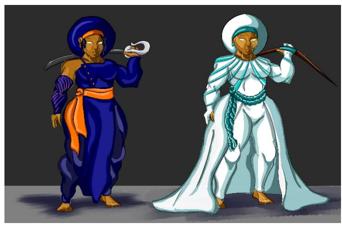
Figure 3: Concept work for An Angel's Elevation

Cap comes with it to cover our head and hair, along with belts to tie around our waist and shoes are removed for services. Every Sunday service, every vigil, or special conference, people wear these garments. This was how I imagined the clothing the angels would wear because