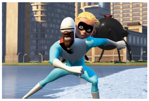
Figure 6: The Incredibles (2004)

I grew up loving animated films that were released in theaters and the shows that came on