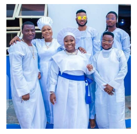
Figure 2: Celestial Church of Christ Members

My characters are angels based on the Christian religion. The inspiration in their physical appearance comes from the royal themes of afro-futurism. Another inspiration in their appearance is from the Cherubim and Seraphim Movement and the practice of praying to God