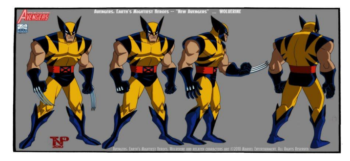
Figure 4: Concept work for The Avengers (Cartoon Series)

unappreciated in today's landscape. I feel that the concept designs in video games and anime have a lot of depth to their making and personality to the world we crave to live in. These efforts are essential