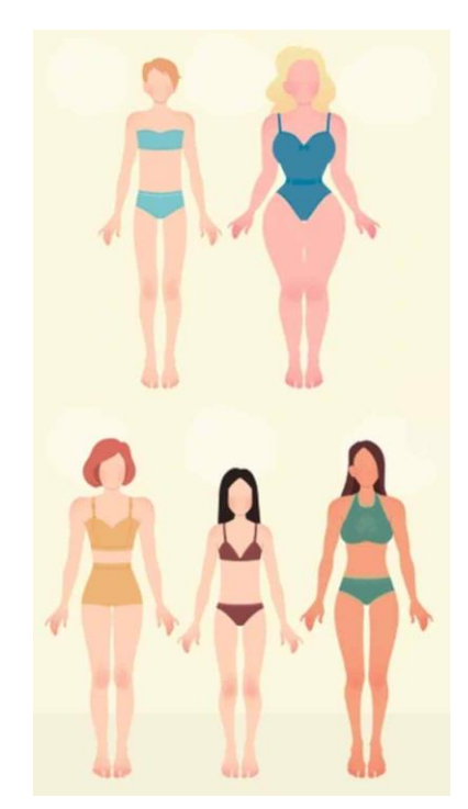
Figure 7: Body types (Bright Side)

The depiction of women's appearance in the media has undergone transformation across eras. Initially, there was emphasis on tall, skinny figures, followed by a trend toward skinny yet voluptuous bodies, and later, curvy hourglass shapes gained prominence. While the media still exhibits imperfections, there has been a gradual shift toward inclusivity. However, representation often overlooks portraying women as strong and active individuals, highlighting muscularity and physical strength. Personally, I envision people akin to superheroes, who hone their bodies through rigorous training to maximize their strength. Typically, the portrayal of muscularity is geared